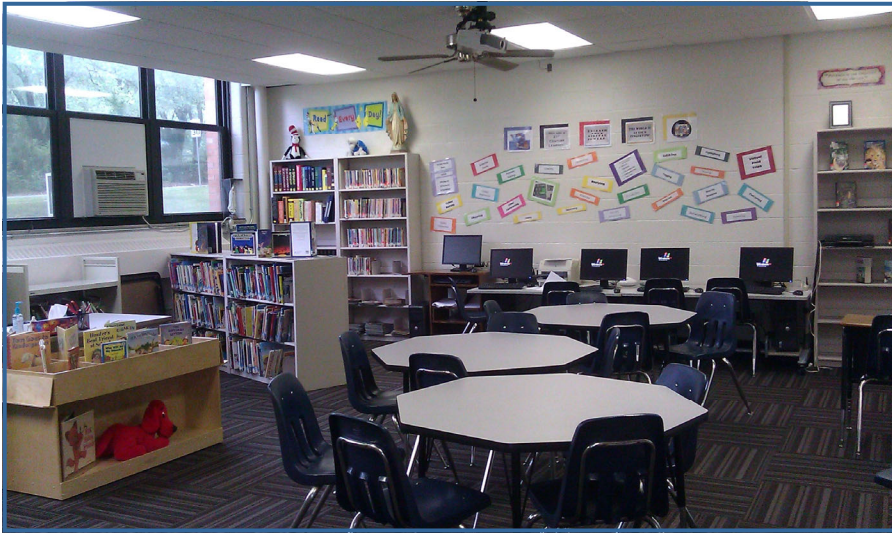
The contents of the former school library, with the addition of new technology equipment, have together furnished a new Library & Media Center room in a larger classroom..